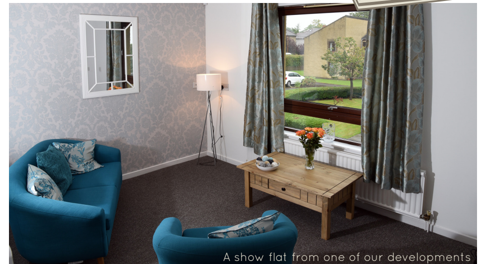
A show flat from one of our developments