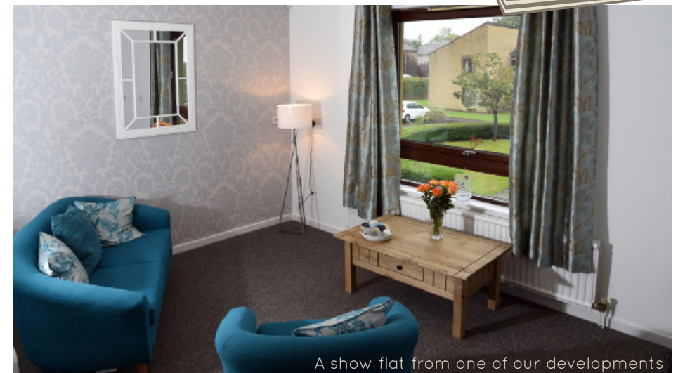
A show flat from one of our developments