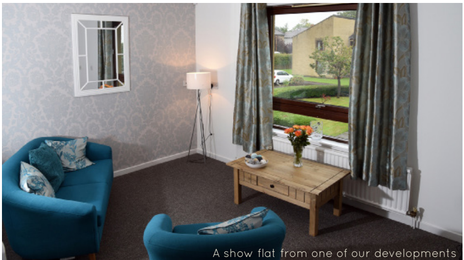
A show flat from one of our developments